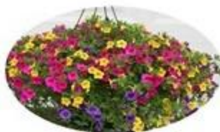
Pure Joy Mix

Pure Joy Mix The hottest callie mix out there in Rose, Blue and Yellow