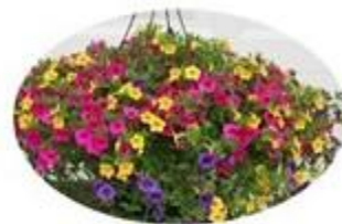
Pure Joy Mix